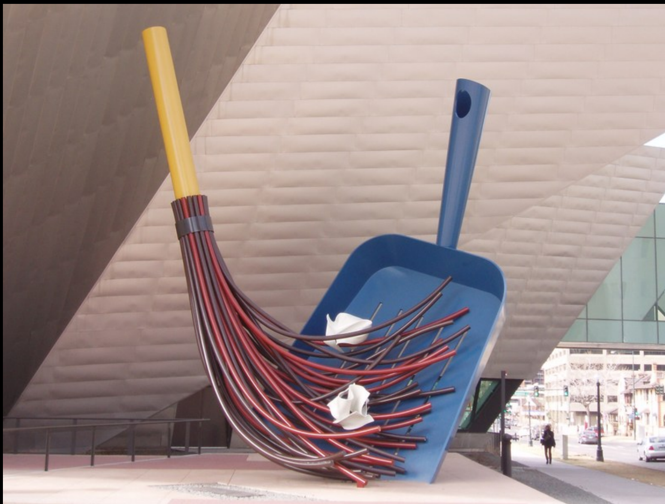
Big Sweep, 2006 Stainless steel, aluminum, fiber-reinforced plastic; painted with polyurethane enamel Denver Art Museum, Denver, Colorado